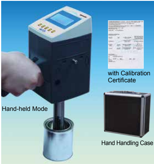
(1) for 25~150,000cP, “WVH-0.15M” full set (2) for 50~300,000cP, “WVH-0.3M” full set