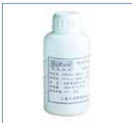
(4) Standard Oil 3,000 cP