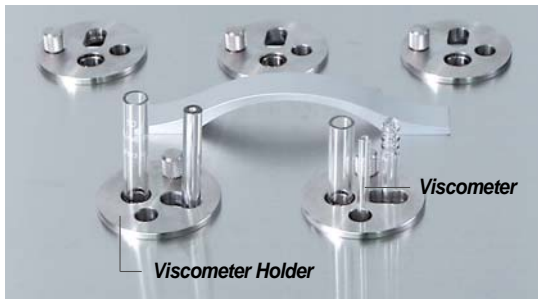
Flat Lid with Viscometer Holder