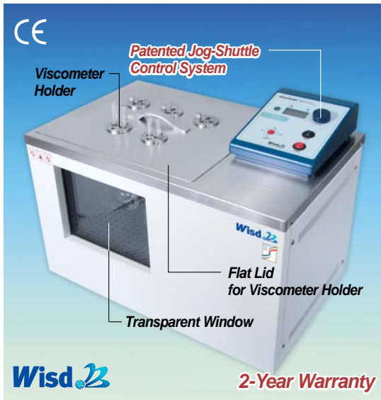
Digital Precise Viscosity Bath “WVB-30”, included Flat Lid for Viscometer Holder (without Viscometer Holder)

DAIHAN-brand® Digital Precise Viscosity Bath, “WVB”, Available 5 × Viscometer, up to 100°C, ±0.1°C with 5-/9-Holes Stainless steel Lid for Viscometer Holder, Available Reverse & Routine-type Viscometer, Transparent Window, 30 Lit.