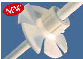
(2) "Turbine" Rotor Only \phi 50 \sim \phi 150 mm