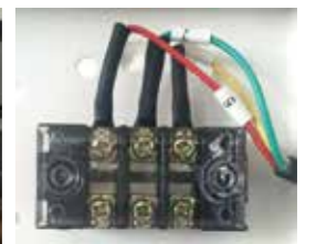
Remote alarm contact